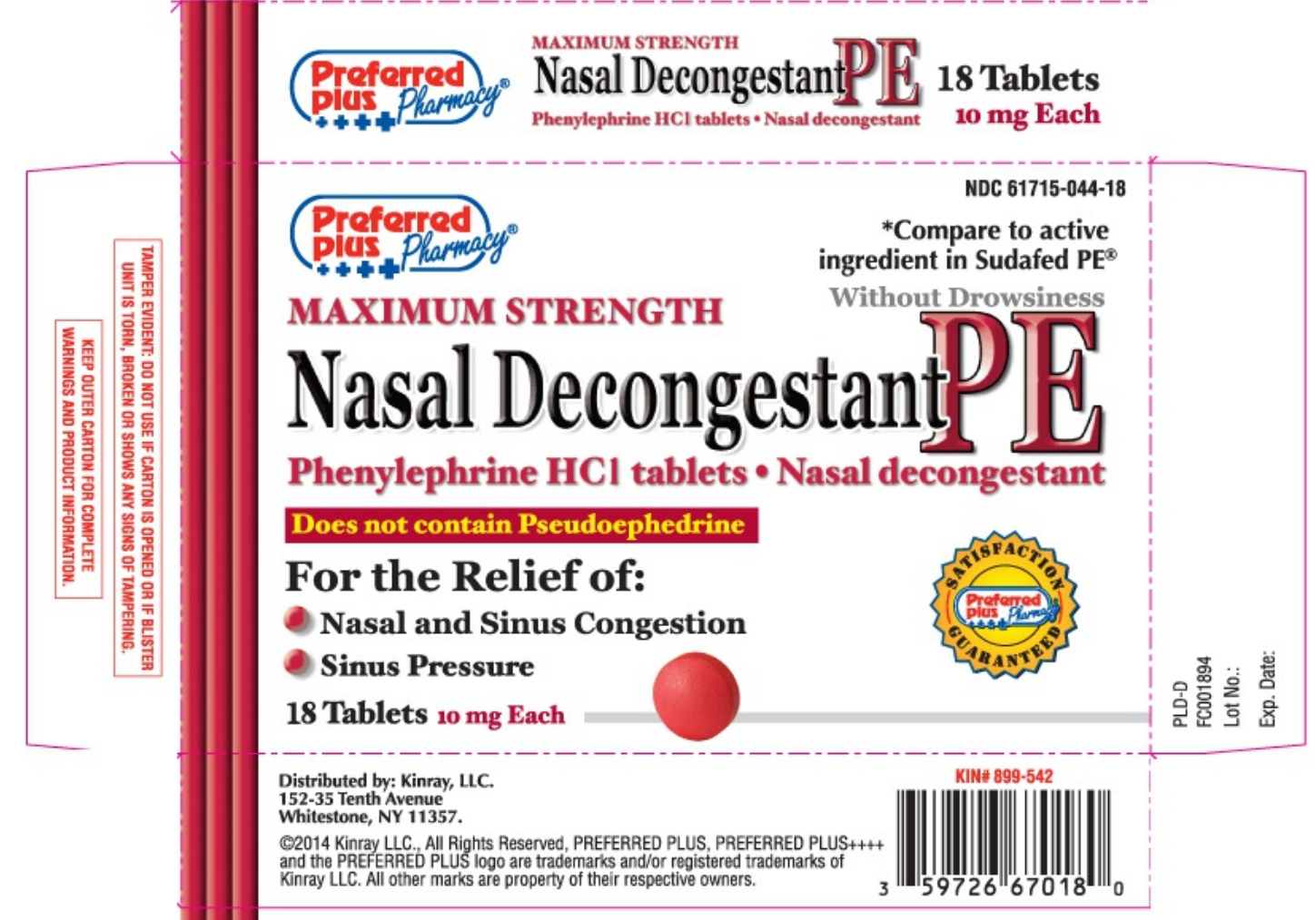
Preferred Plus Nasal Decongestant PE Tablet

NASAL DECONGESTANT PE MAXIMUM STRENGTH phenylephrine hydrochloride tablet