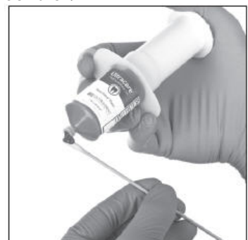
Fig. 2 Deliver Ultracare from the large, no-waste