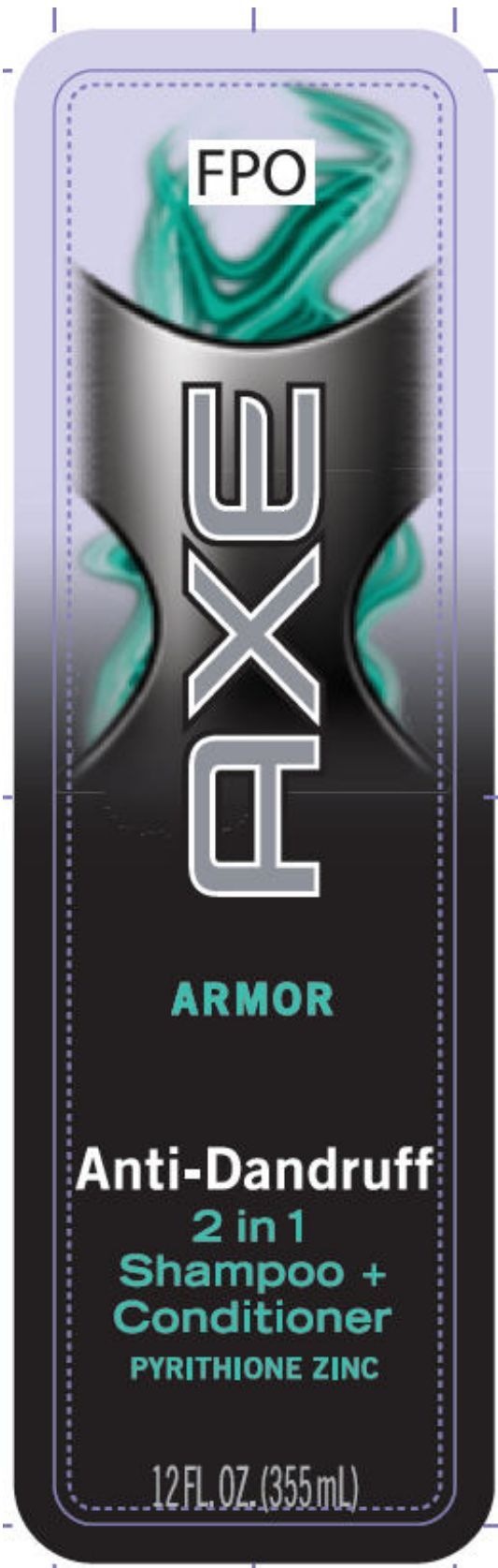
PDP 12 oz back