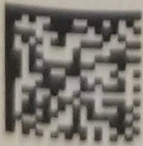
Sincerus Florida, LLC, adverse reactions