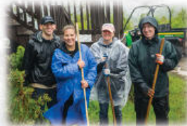
Employee Volunteer Day Mt. Agamenticus - York, Maine

5% (12 days) of employee time to volunteering. 10% of profits to human and environmental goodness.