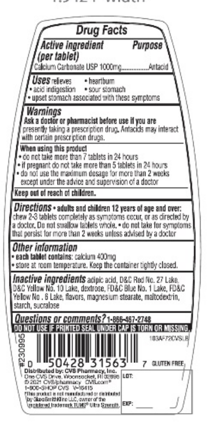
Package Label for 160Chewable Tablets