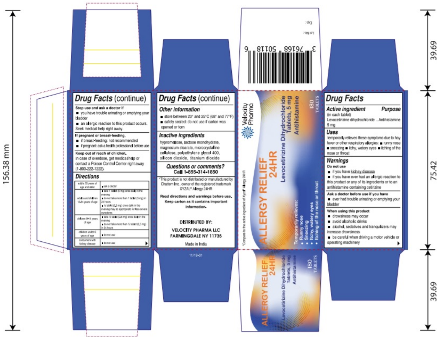
Label for Allergy Relief 10 Tablets in a bottle