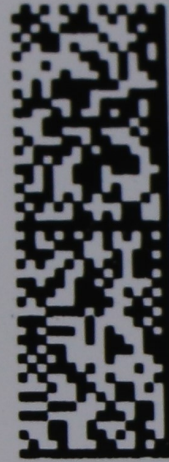
PRINCIPAL DISPLAY PANEL, VIAL LABELING