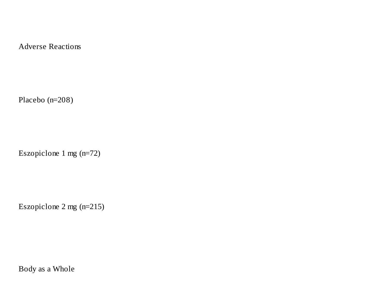
Table 2: Incidence (%) of Adverse Reactions in Elderly Adults (Ages 65 to 86) in 2-Week Placebo-Controlled Trials with Eszopiclone 1

Table 2 shows the incidence of adverse reactions from combined Phase 3 placebo-controlled studies of eszopiclone at doses of 1 or 2 mg in elderly adults (ages 65 to 86). Treatment duration in these trials was 14 days. The table includes only reactions that occurred in 2% or more of patients treated with eszopiclone 1 mg or 2 mg in which the incidence in patients treated with eszopiclone was greater than the incidence in placebo-treated patients.