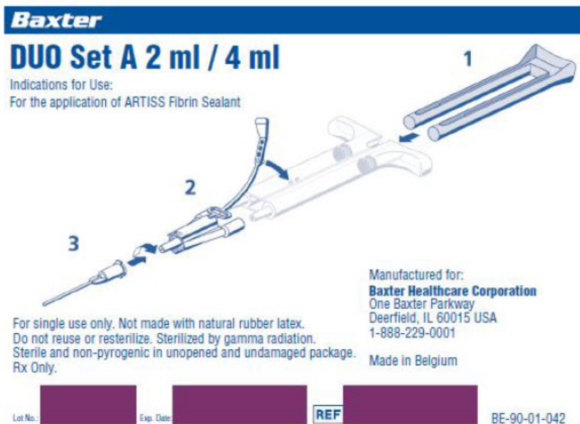
DUO Set A 2 ml / 4 ml Label