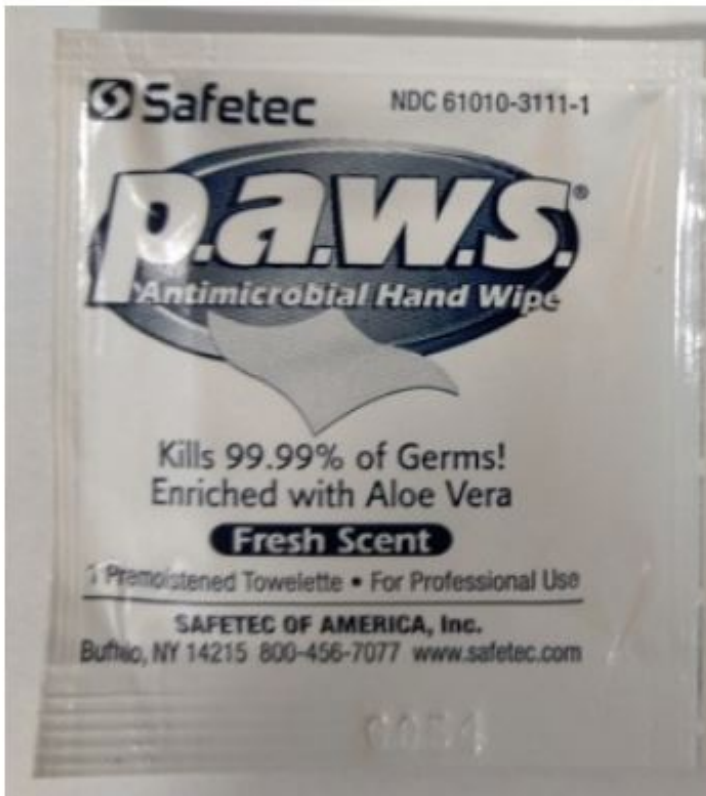
Alcohol Wipe Principal Display Panel