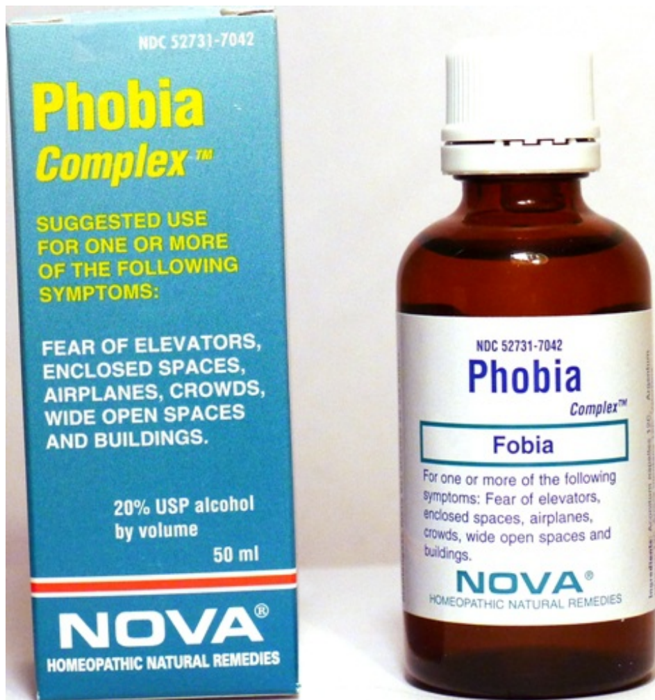
Phobia Complex Bottle Label