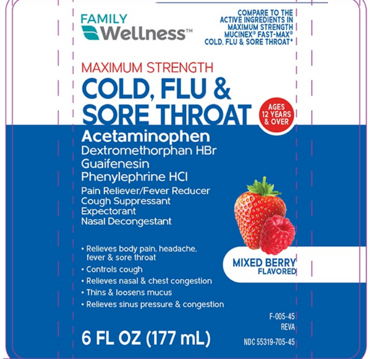
Family Wellness 44-005