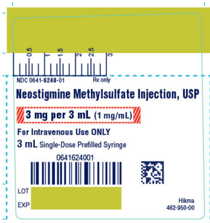
Neostigmine Methylsulfate Injection 3 mg per 3 mL Syringe Label