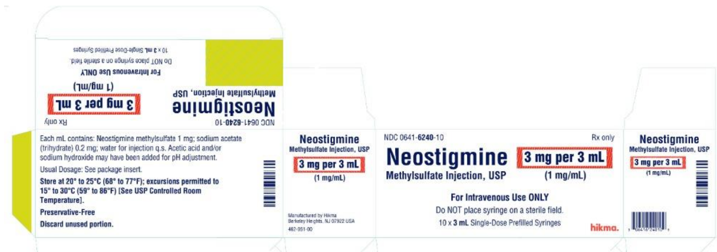
Neostigmine Methylsulfate Injection 3 mg per 3 mL Syringe Carton Label

10 x 3 mL Single-Dose Prefilled Syringes