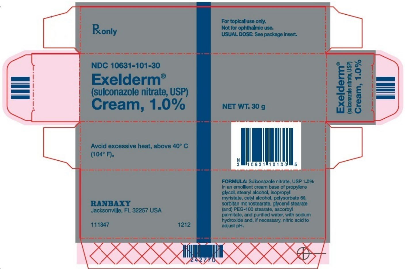
Exelderm Cream 30g Tube