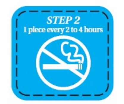
At the Beginning of Week #7