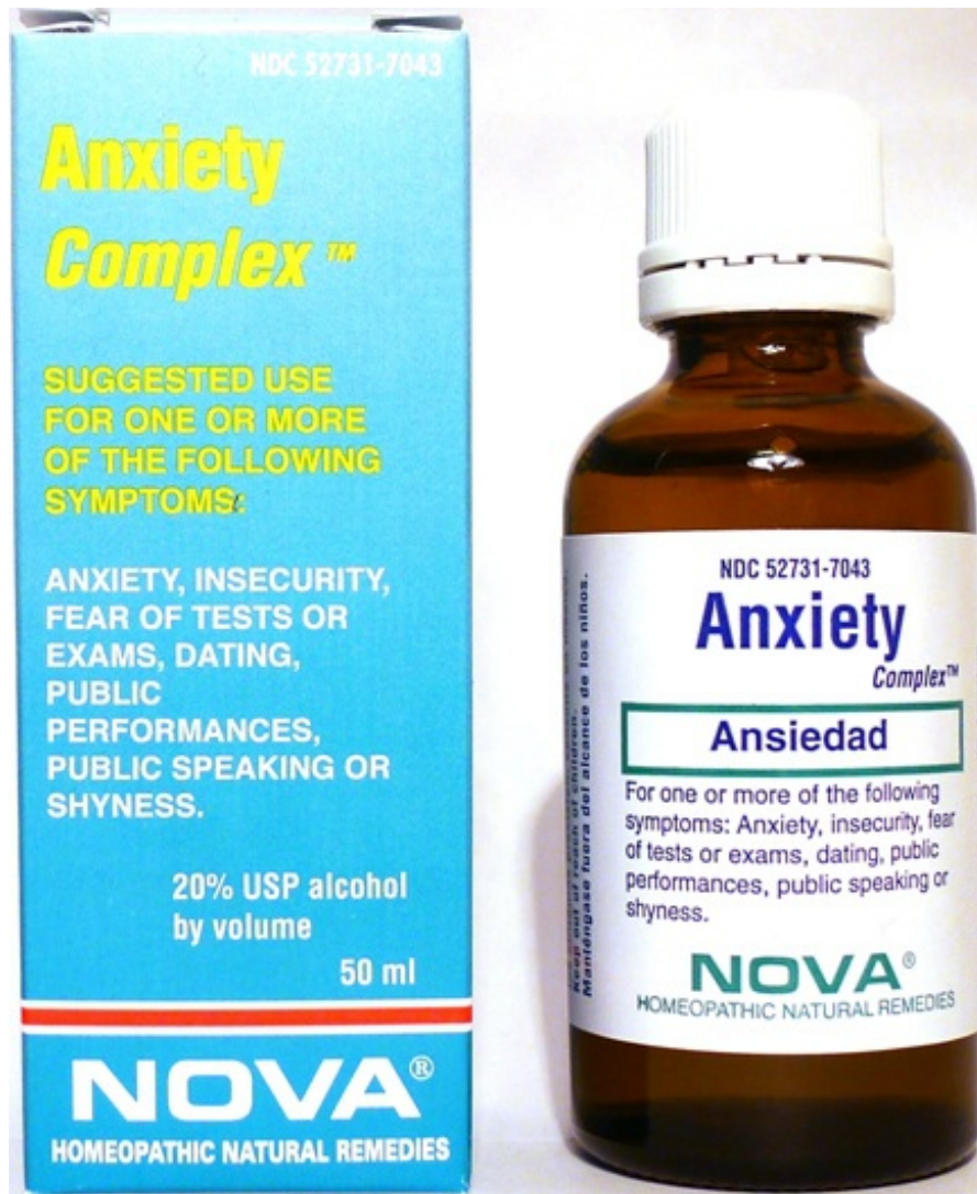
Anxiety Complex Bottle Label