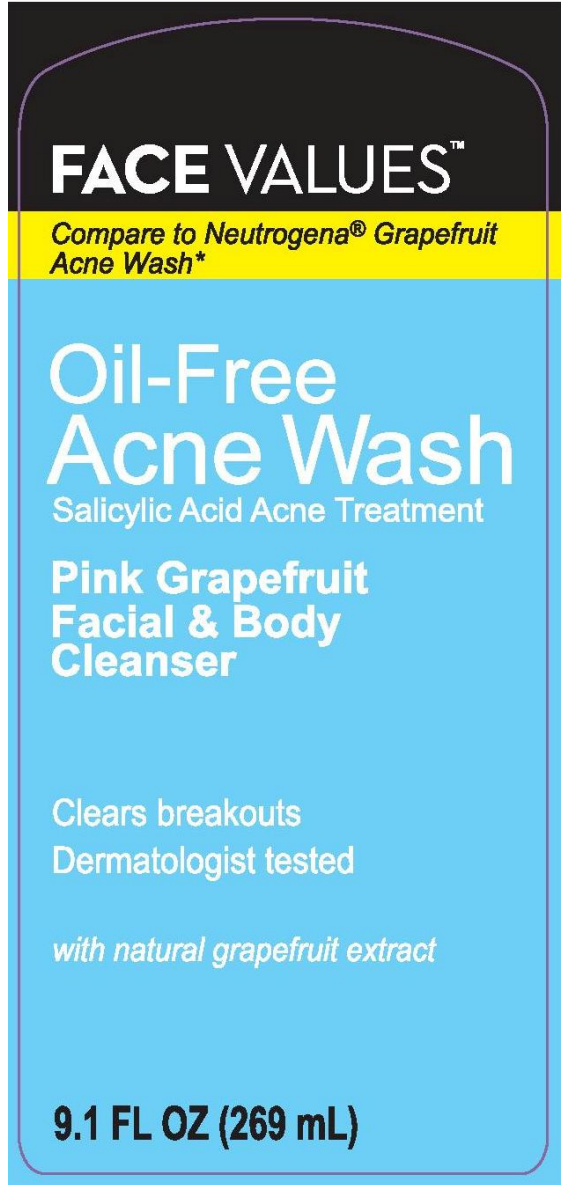
Front Colors: K / Yellow / White