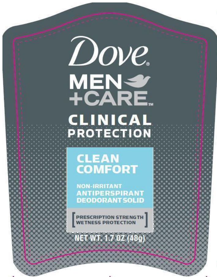
1.7 oz carton