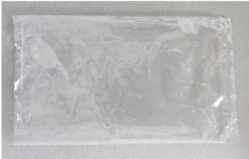
80184-997-14 Blue Kit Package