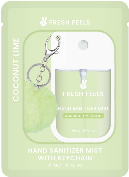
Outer Package Label