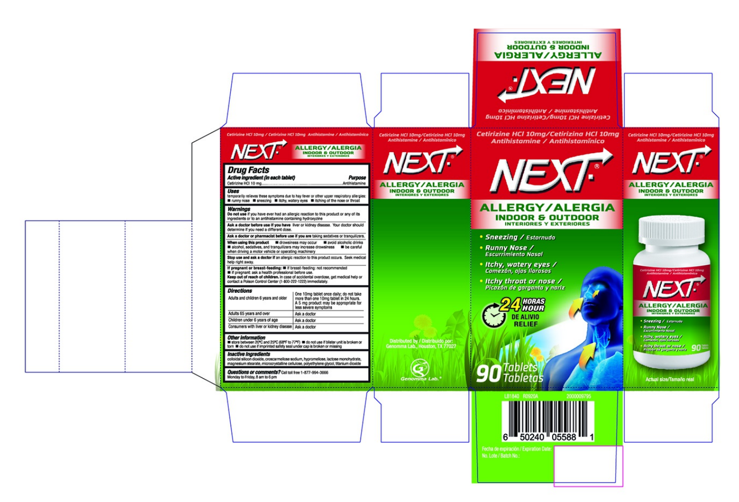
Cetirizine 10mg Front