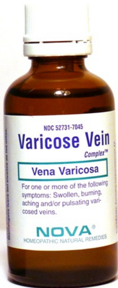
Varicose Vein Complex Bottle Label