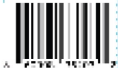
Package Labeling: RAPID PAIN-RELIEF TOPICAL CREAM, 6oz/175ml

Distributed by Nordic Healthy Living, Inc. 1508 Pine St, Apt A Philadelphia, PA 19102