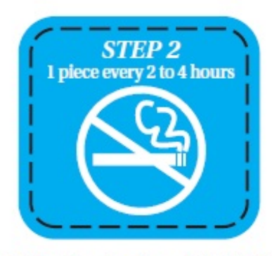
At the Beginning of Week #7