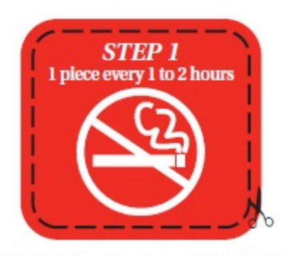
At the Beginning of Week #1 (Quit Date)