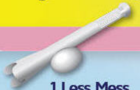
1 Less Mess Ovule® insert