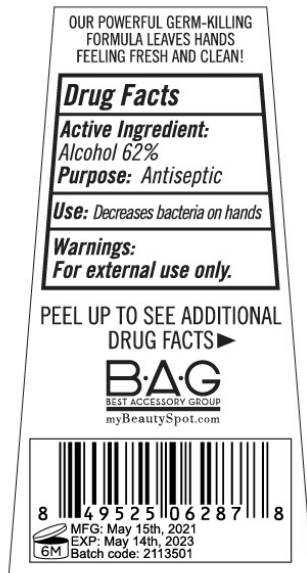
25x47mm 双胶标 光油