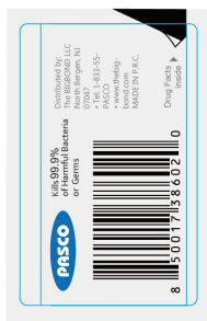
2oz clear A