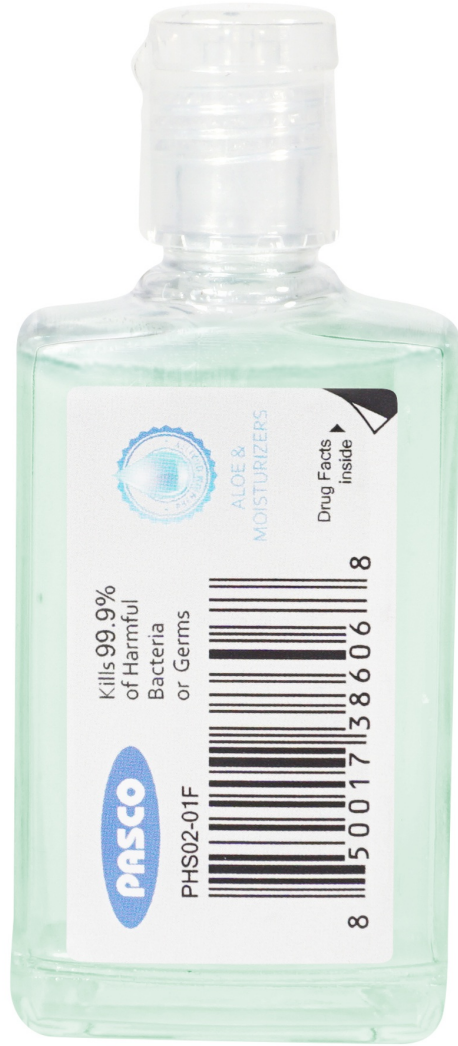
2fl oz Advanced Hand Sanitizer