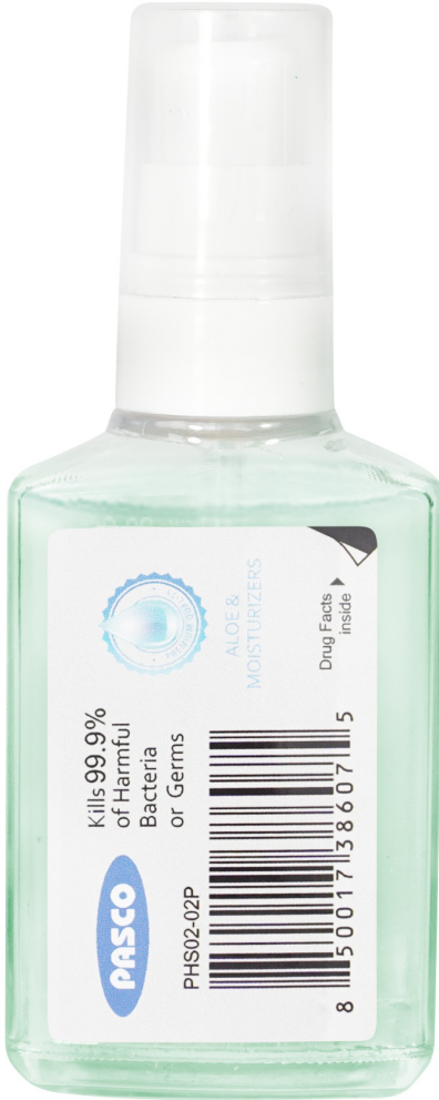
8fl oz Advanced Hand Sanitizer