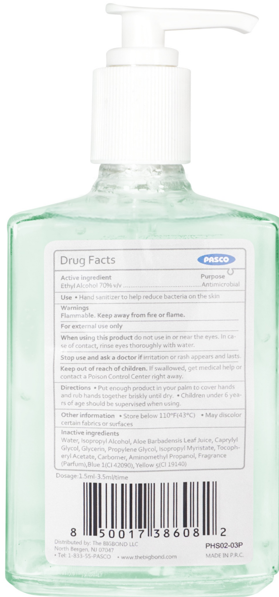
20fl oz Advanced Hand Sanitizer