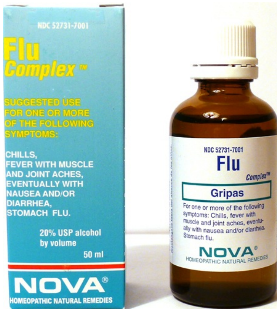
Flu Complex Bottle Label