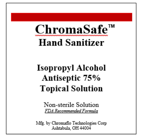
5 gal / 19 L