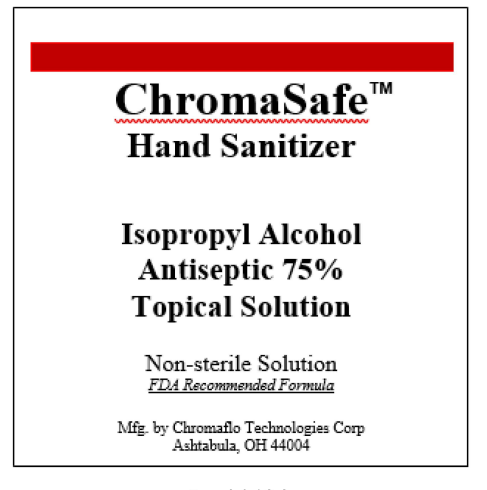
5 gal / 19 L

Isopropyl Alcohol 75% v/v. Purpose: Antiseptic