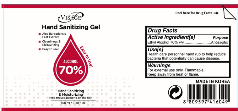
Inner Label (130 x 60 mm)