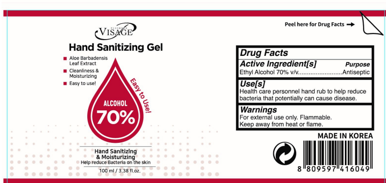
Cover Label (130 x 60 mm)