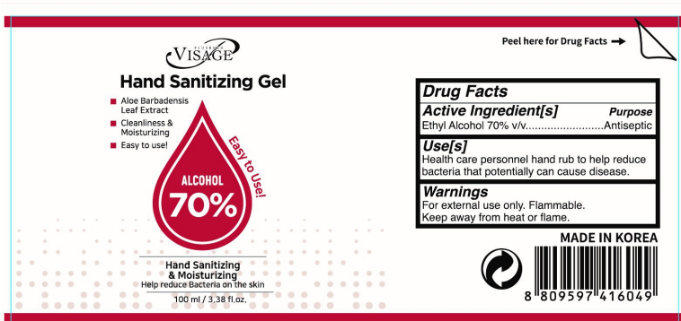
Cover Label (130 x 60 mm)