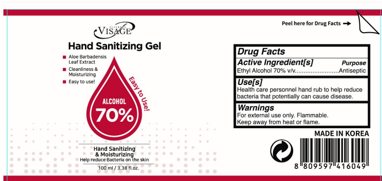
Cover Label (130 x 60 mm)