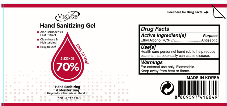
Cover Label (130 x 60 mm)