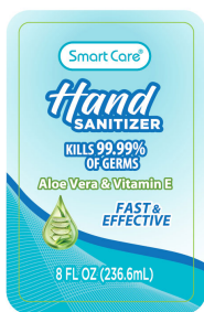
5cm x 8cm