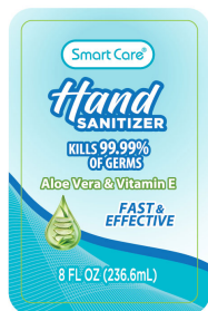
5cm x 8cm