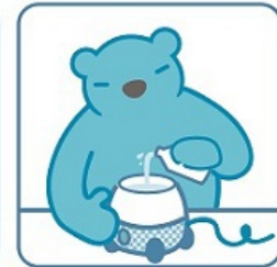
* Pour it into humidifier