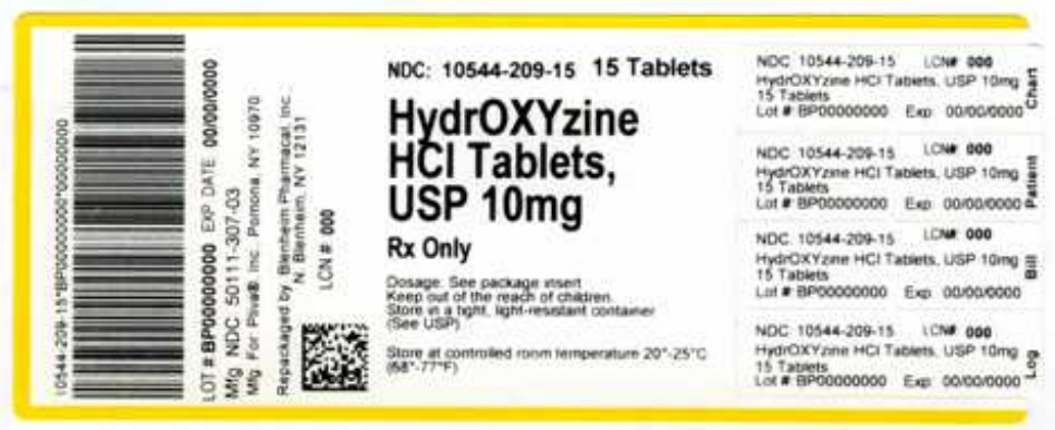
10544-209-15 Bottle Label