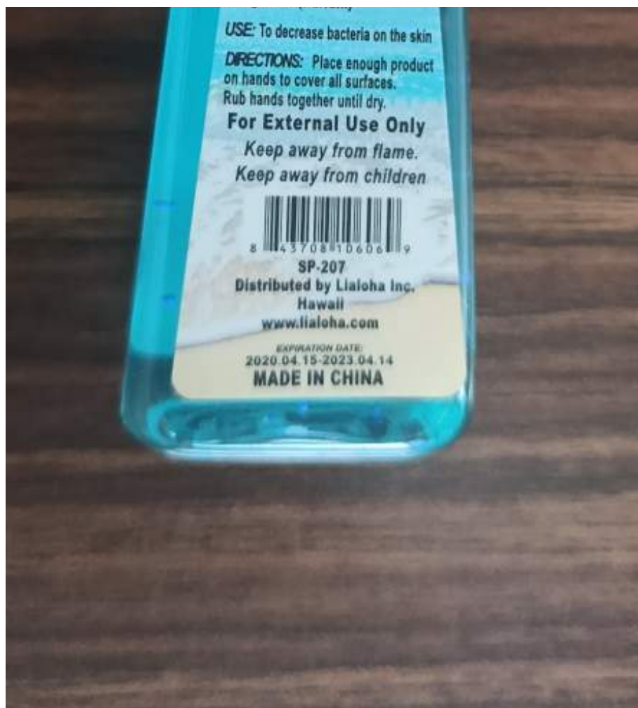
100mL Ocean Breeze NDC 54225-005-02