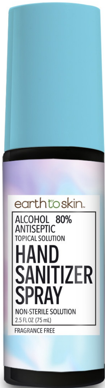
Package Label. Pincipal Display Panel Blue Cap-Back