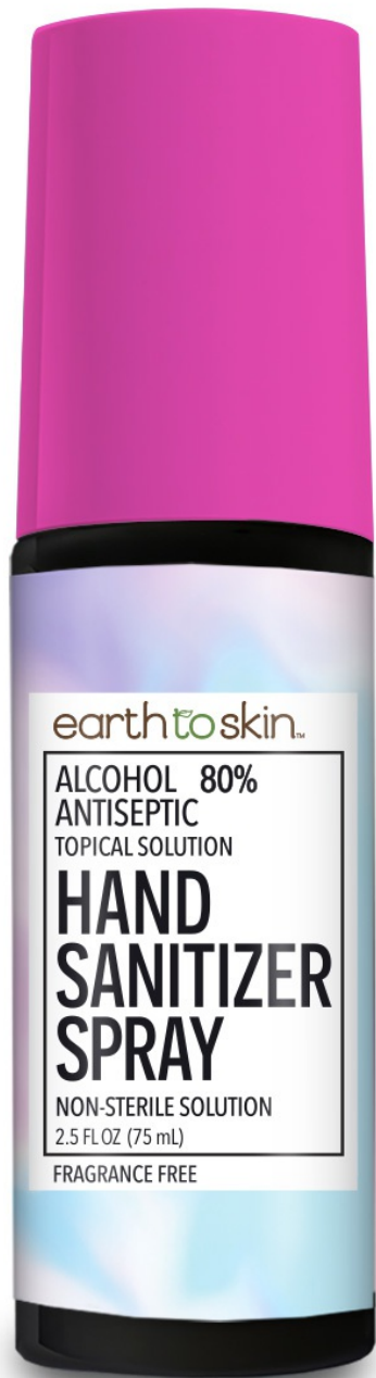
Package Label. Principal Display Panel Pink Cap-Back