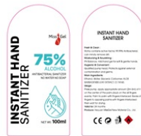
尺寸 : 38X80mm