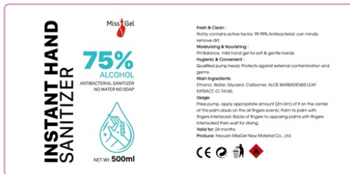
尺寸 : 213X105mm