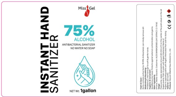
尺寸 : 250X135mm