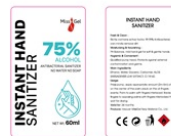
尺寸 : 32X56mm