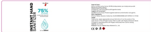
尺寸 : 263X56mm