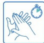
Rub your palms and hands