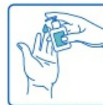
Put a few drops of sanitizer on the palm of your hand