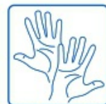
Hands are disinfected