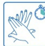
Cover your hands completely until they dry