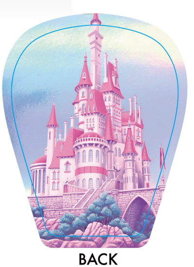
2.9774 in X 3.7571 in laser sticker