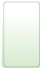
BACK LABEL ADHESIVE SIDE SHOWS THROUGH THE BOTTLE