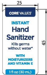
FRONT LABEL CLEAR STOCK