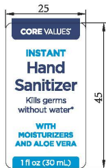
FRONT LABEL CLEAR STOCK