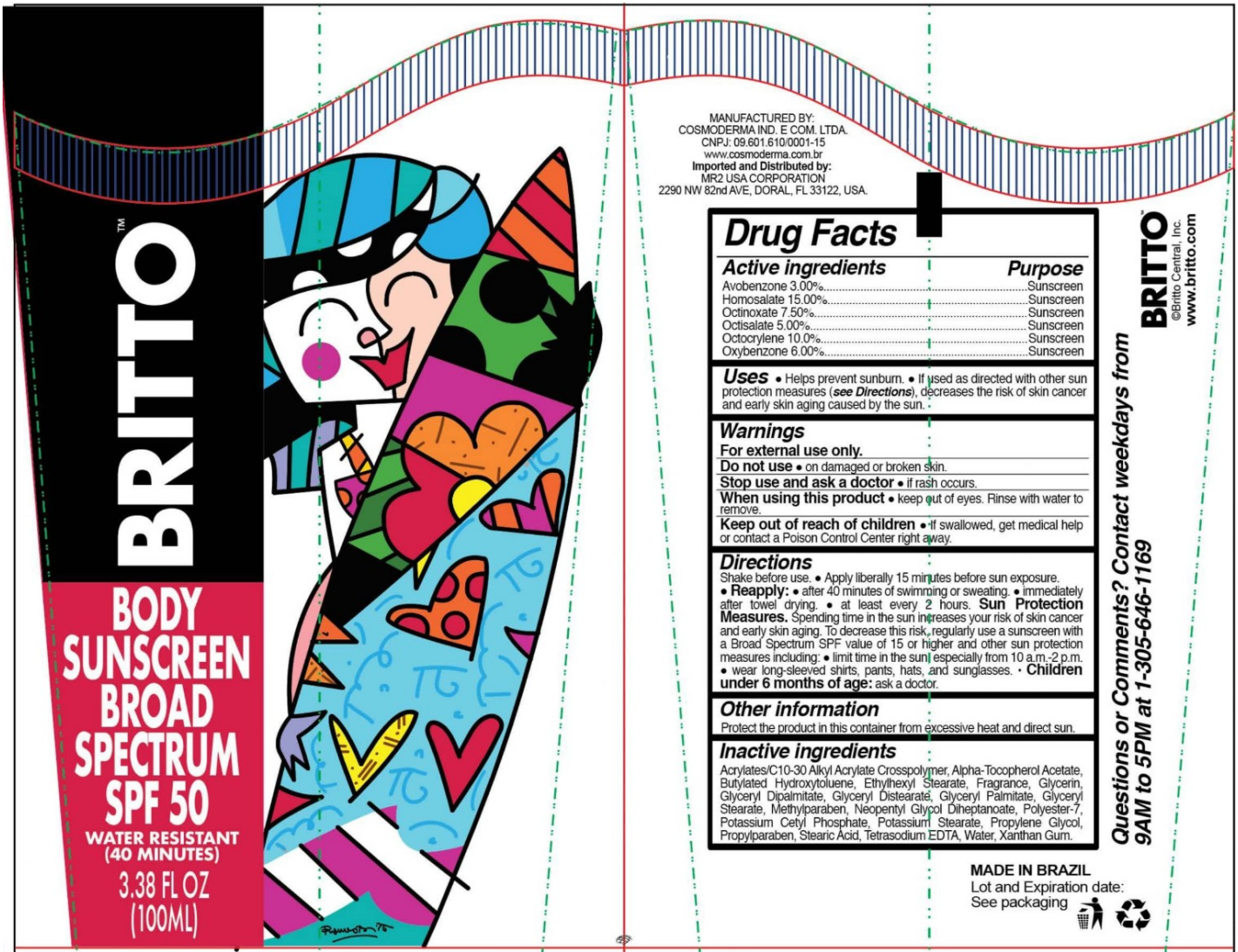
Drug Facts Panel - Warnings - Ask a doctor