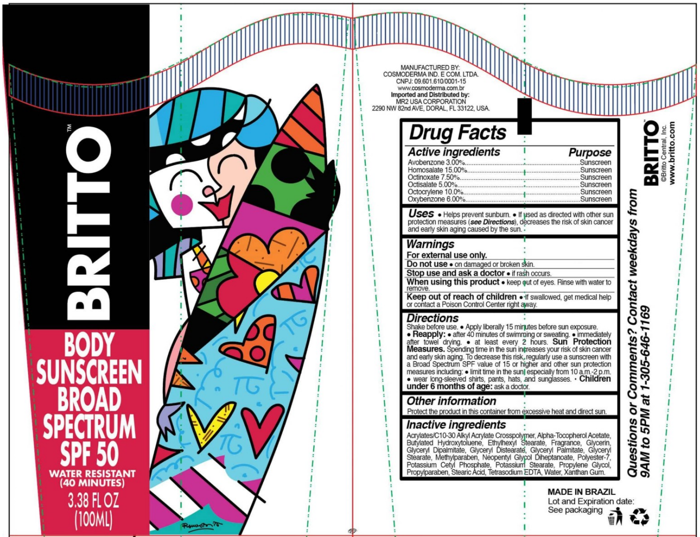
Principal Display Panel