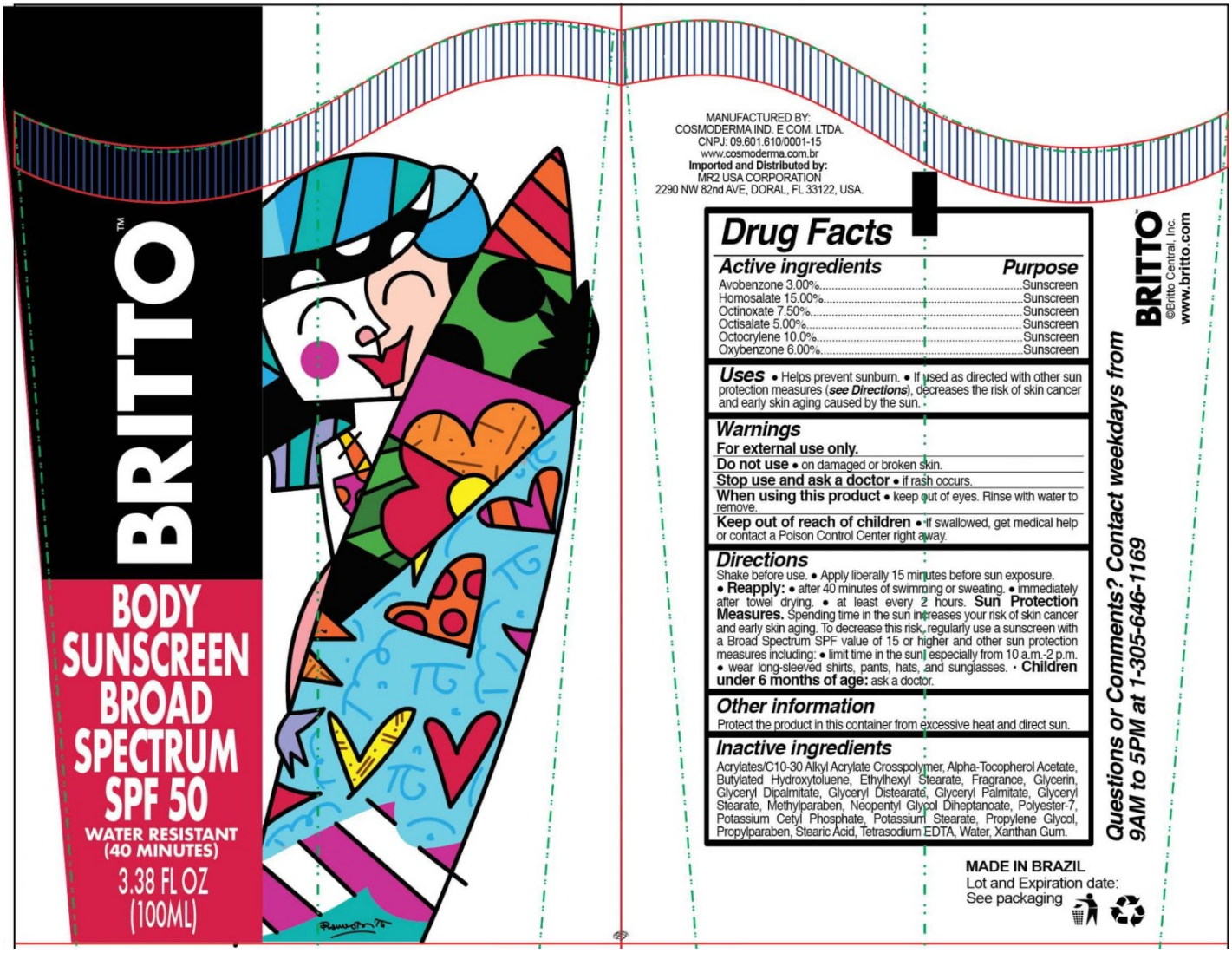
Drug Facts Panel - Inactive Ingredients