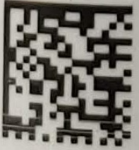
Sincerus Florida, LLC adverse reactions

Office use only. Not for resale. LS-01-000000-00