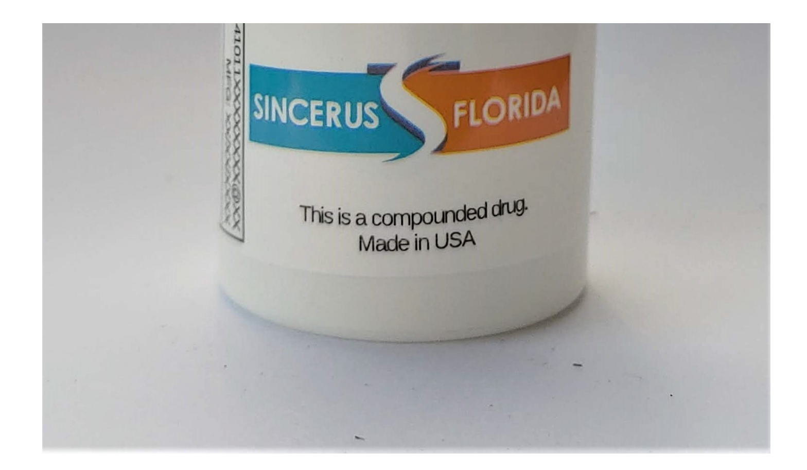
Sincerus Florida, LLC adverse reactions