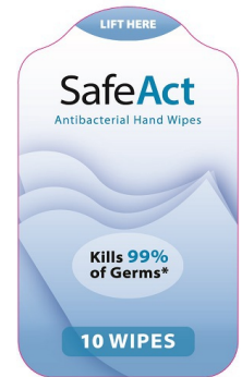
Label size: 86x54mm