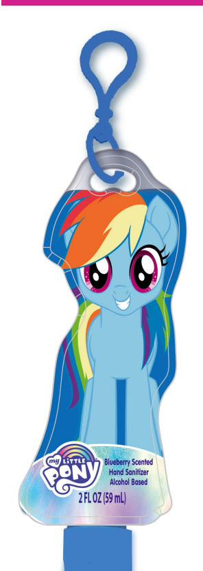
成品尺寸: 84 x 130mm Exp.Date MM/YYYY - PLACE text and character ER (ACUA/EAU), PEG-40 ROGENATED CASTOR OI GRANCE (PARFUM), VLATESIC10-30 ALKYL YLATE CROSSPOLYMER,

Exp.Date MM/YYYY - PLACE -第一张双面印刷 FRONT BACK