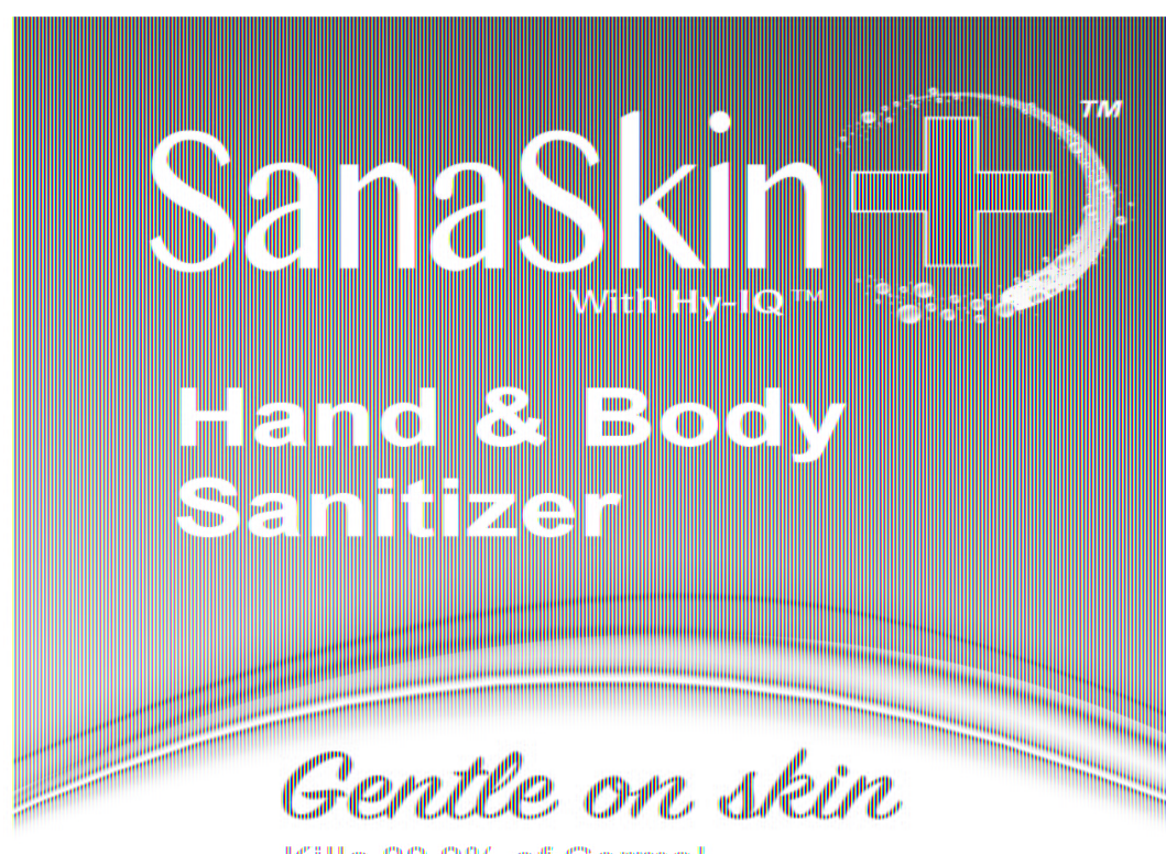
Kills 99.9% of Germs! Keeps working hours after use.