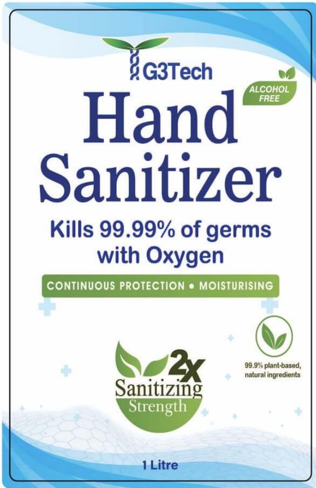
Label sticker 80mm x 125mm _1 Litre Front