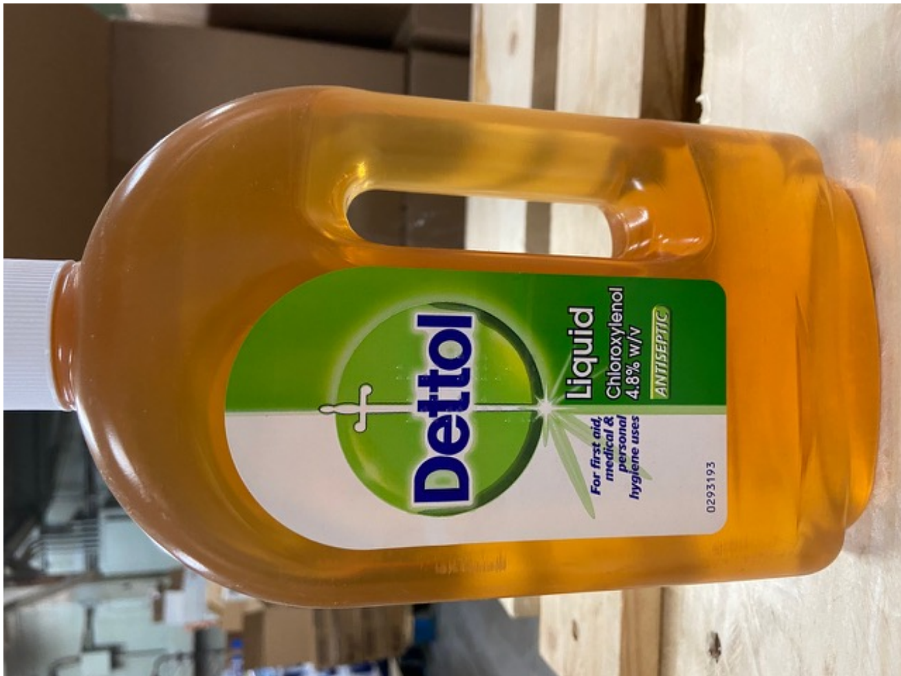
Chloroxylenol 4.8% w/v. Purpose: Antiseptic