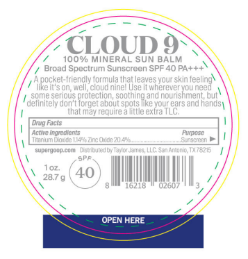
Primary Display Panel - Top Layer