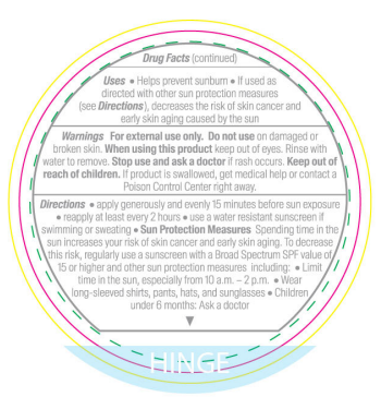
Back of Primary Display Panel (Usually Gray Text)